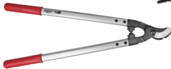
LPB-20S LPB-20M LPB-20L B C 476 825 B C 624 940 B C 772 1055