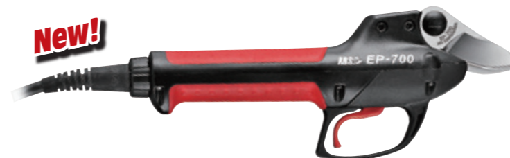
New! H C 270 830 ARSEP-700-1