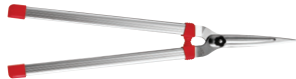
N C 650 640 K-900