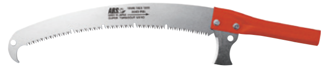
UV-40 H C 630 520 UV-40-1