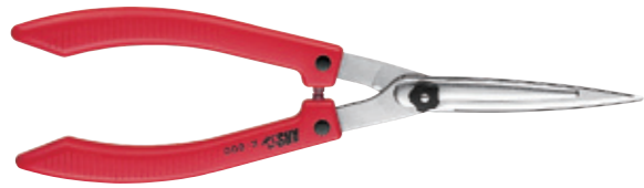
N C 500 550 K-800