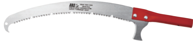
UV-47 N C 670 500 UV-47-1