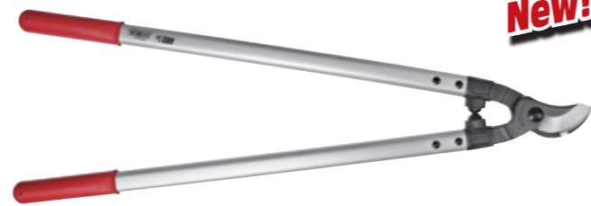
LPB-30S LPB-30M LPB-30L B C 482 860 B C 630 975 B C 778 1090